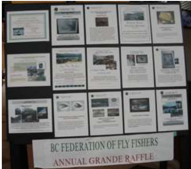
15 great prizes offered this year